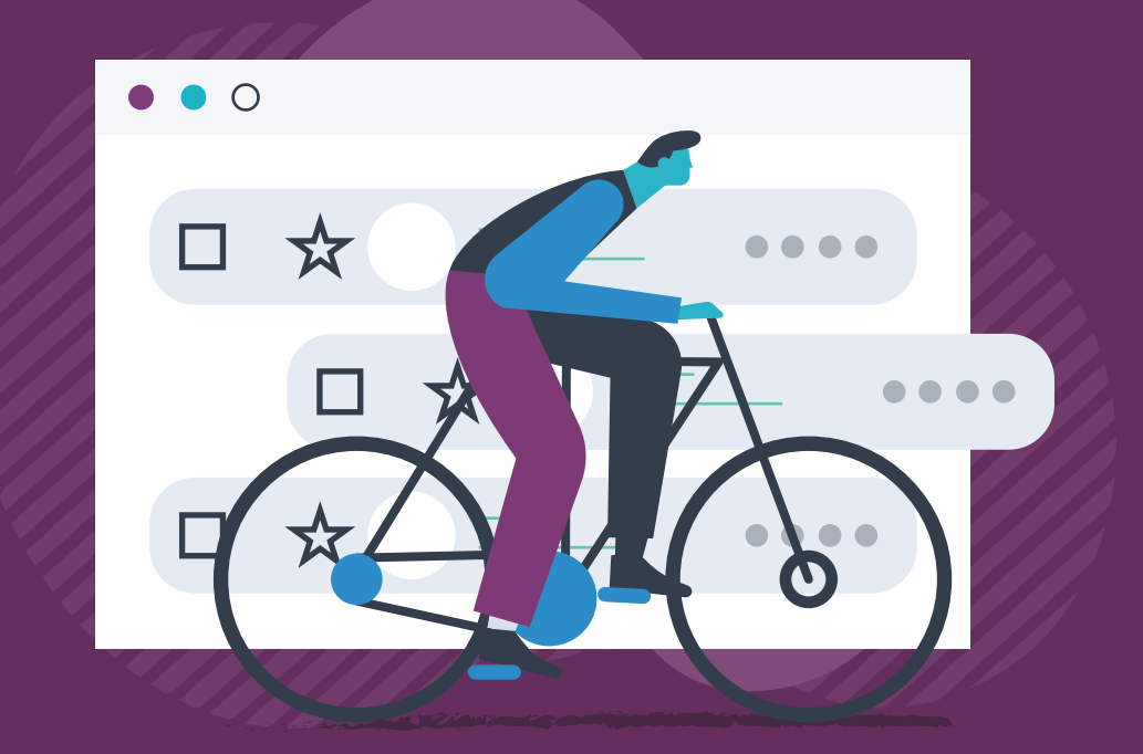
Find ways to integrate advanced tech into business processes to drive engagement.

Consider student loan reduction plans as part of your benefits package