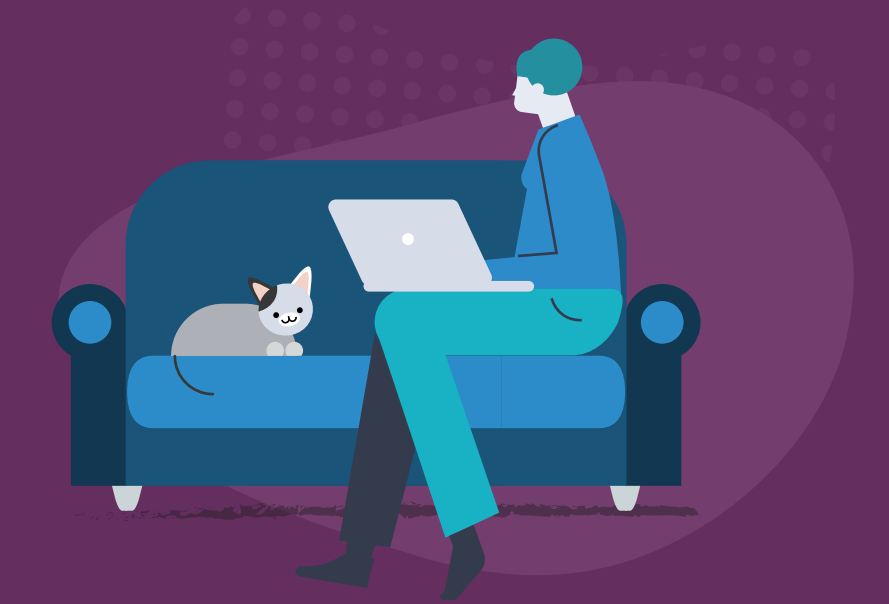
Offer flexible work hours. Millennials put a high value on work/life balance